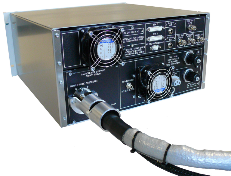
Rear Panel Shown with 1.5 mm Inside Diameter Heated Sample Line for Shortest Response Time

Low cost of ownership. Low fuel gas consumption. The combustion air supply for the FID-detector is built in. No external cylinder for synthetic burner air is needed.