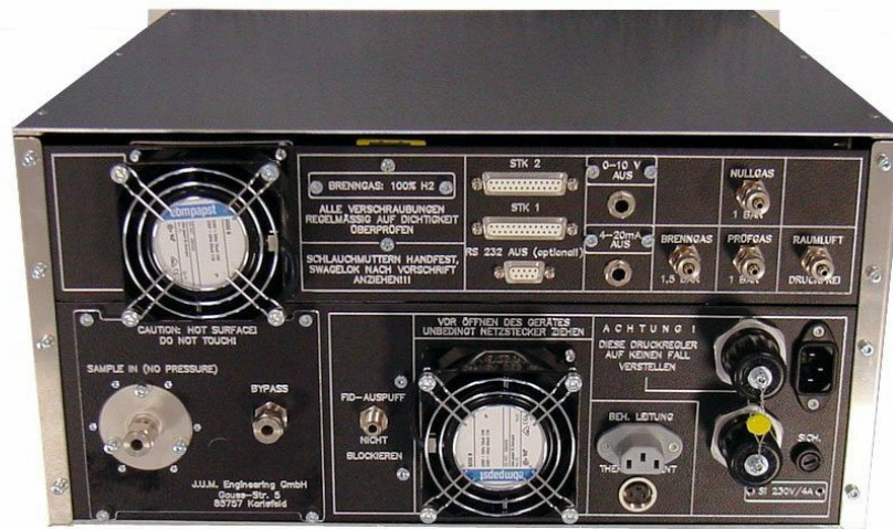
Complete rear view shown; sample in, sample bypass, zero and span gas inlets including optional internal heated line temperature controller

Low cost of ownership. Low fuel gas consumption. The combustion air supply for the FID detector is built in. No external source or cylinder for synthetic burner air is needed.