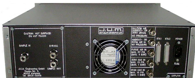
Rear Panel View