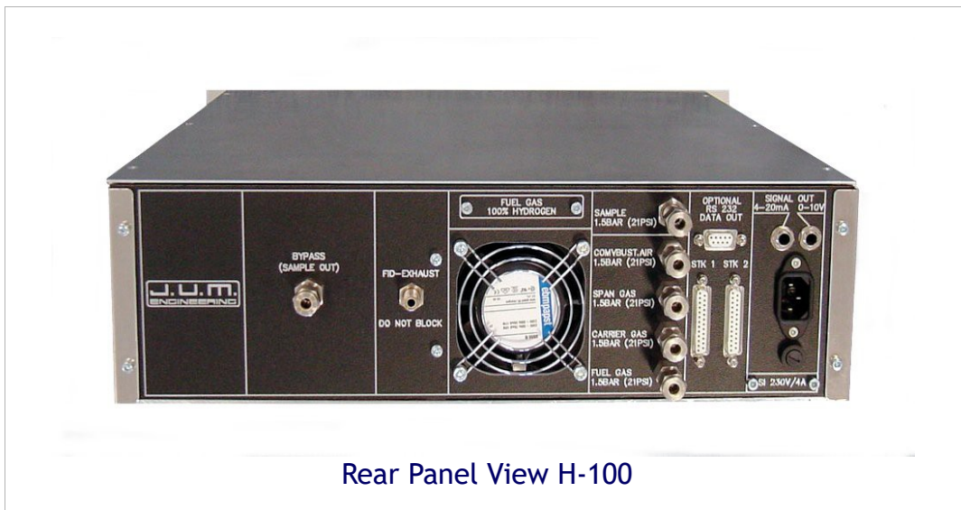
Rear Panel View H-100