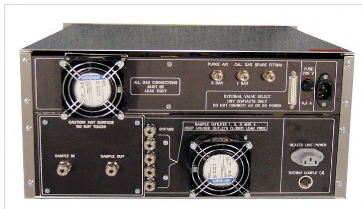
Rear panel shown with optional heated sample line controller connections

A calibration gas inlet offers the capability to test and calibrate the complete analyzer circuit. Our proprietary rear panel adapter plate system allows cold-spot free coupling of a heated sample line inside the heated oven without the need of special tools.