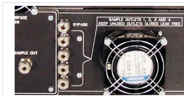
Detail of all sample outlet capabilities; Connect HFID plus 4 other measuring or sampling devices, all @ atmospheric pressure.